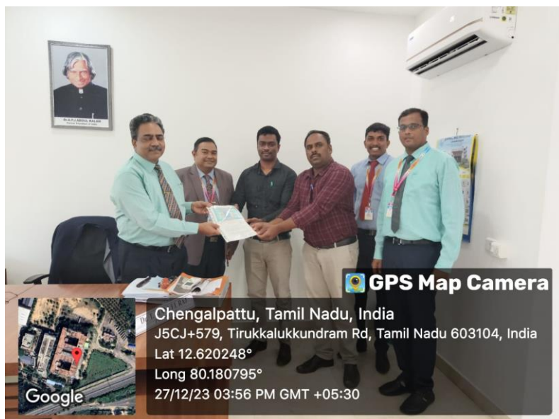
Signed MOU with LogSkim for Core company Placements