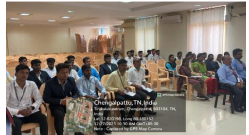
Audience during Pre Placement Talk