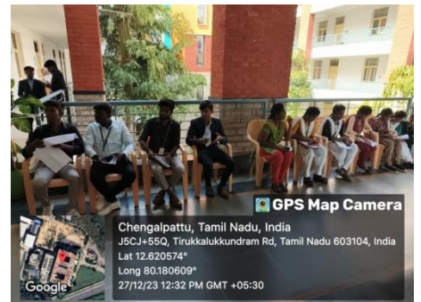
Students waiting to attend Personal Interview