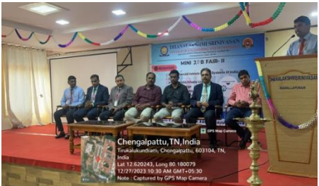
Welcome Speech by Placement Officer