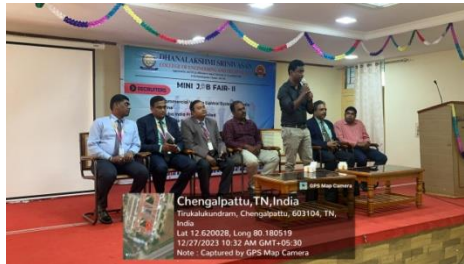
Pre Placement Talk